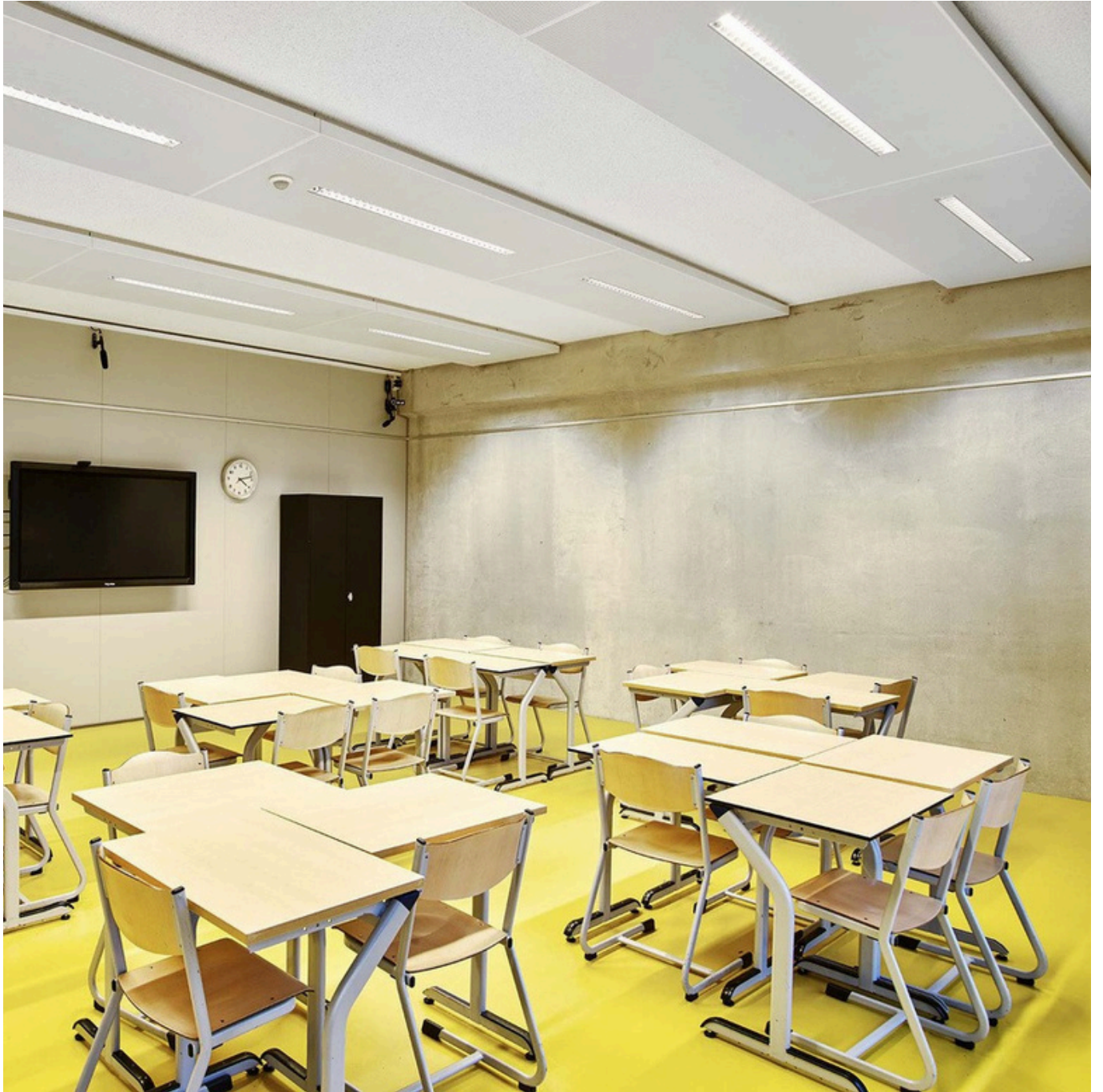
'Melanchton', school in The Netherlands