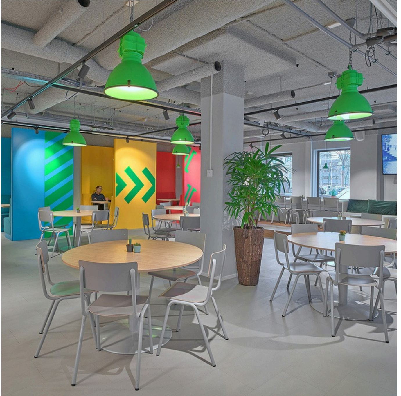
ParcNow office in Amsterdam, The Netherlands